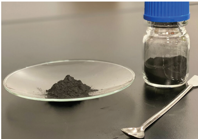
Recycled graphite reclaimed using the Hydro-to-Anode ® process.