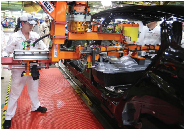
An associate at the Marysville Auto Plant installs a battery in a hybrid Accord.